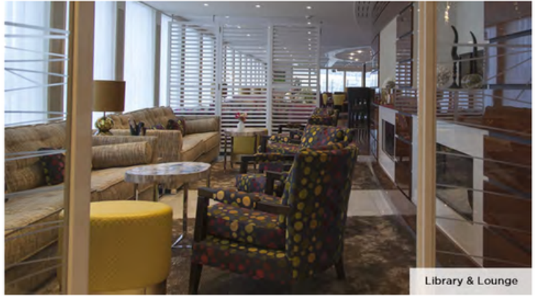
Library & Lounge